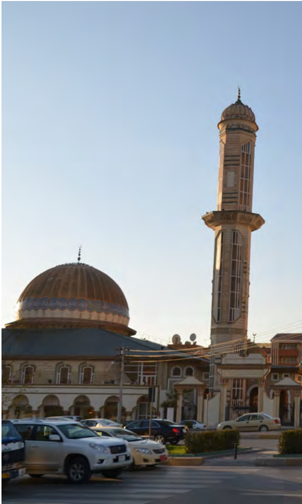
Left, a mosque and new mall in Sulaimani.