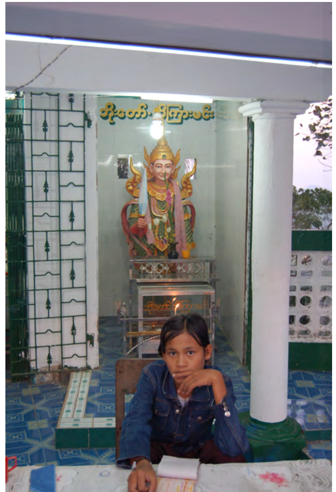
Donation cashier, Mawlamyine, Dec. 2008.

The locations of the project are the Newar-run Theravāda monasteries and meditation centres in the Nepalese cities Lalitpur and Kathmandu (e.g. Dharmakirti Vihara) and comparable Mon-run institutions in Mawlamyine (e.g. Khemarama Vihara) in Mon State. On the Nepalese side, the practices under scrutiny consist of a set of early childhood rituals modeled upon marriage and the temporary taking of monastic vows (Nepali/Newar: ṛṣini), imported from Burma/Myanmar in the 1960s and rapidly replacing older Newar