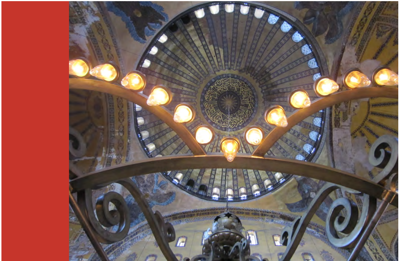
Hagia Sophia, dome interior.