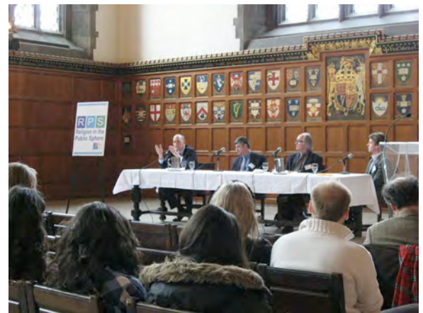
RPS Forum on March 20, 2013 at the Great Hall, Hart House